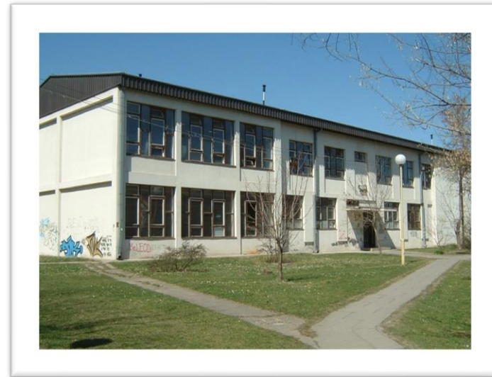
Department of Chemistry