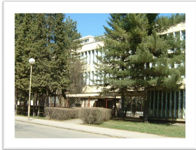
Department of Physics