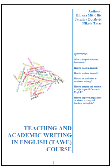
Figures 1-2. Cover pages of Volume STRENGTHENING TEACHER COMPETENCES – TEACHING AND ACADEMIC WRITWNING IN ENGLISH

The term English Medium Instruction (EMI) is usually defined as "the use of the English language to teach academic subjects (other than English itself) in countries or jurisdictions where the first language (L1) of the majority of the population is not English."